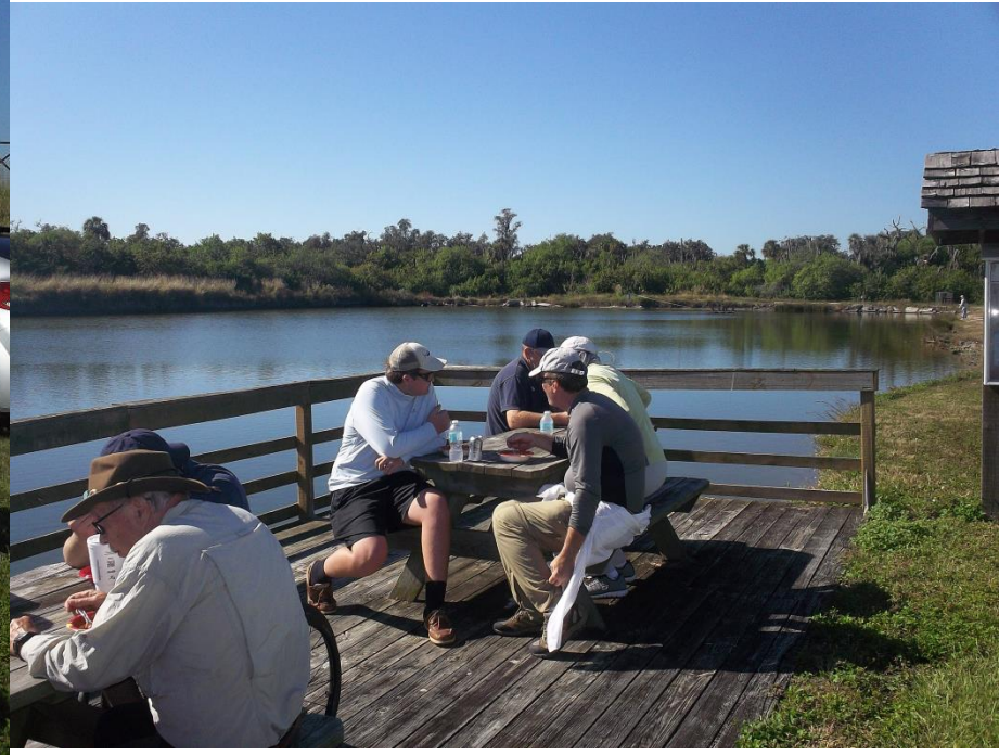
Hooky at the Hatchery: fishing and eating on a beautiful day!