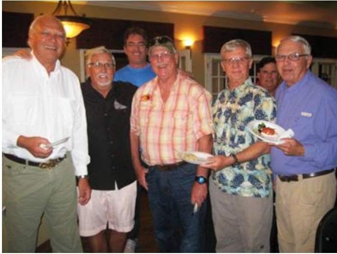
7 guys having fun