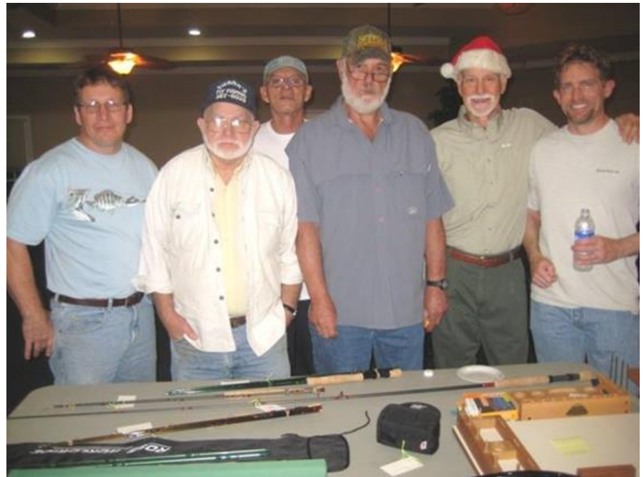
Santa with friends