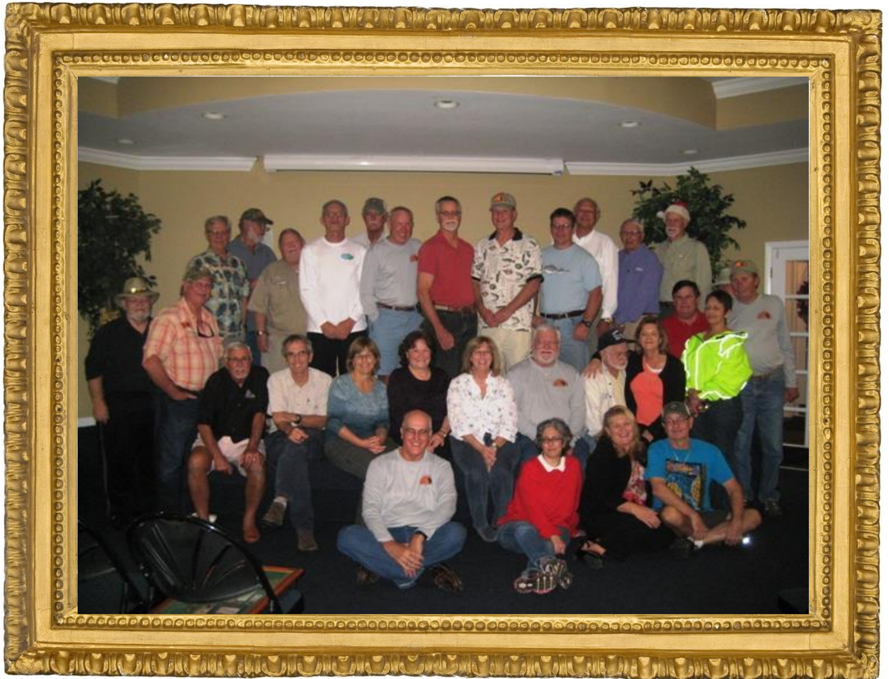
Holiday Party Group Shot