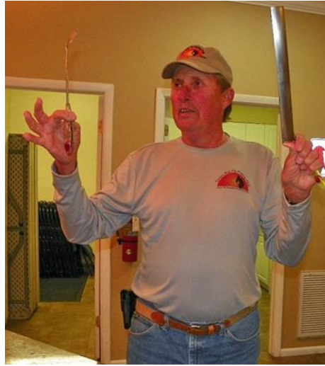
Lance with hush puppy tool