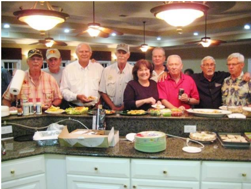
1 girl, 8 guys and food